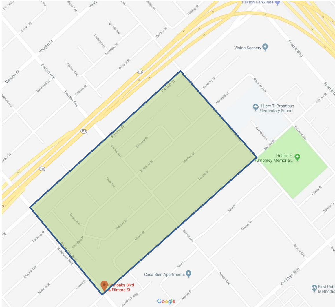
Figure 1. Approximate project boundary (not to scale).