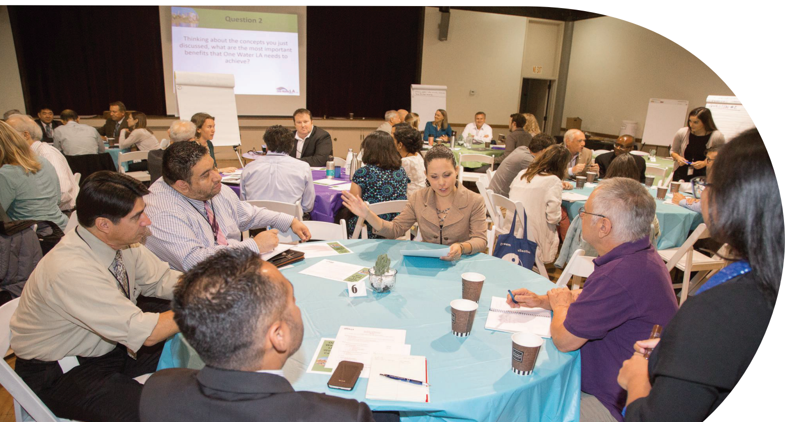
STAKEHOLDERS HELP IDENTIFY THE MOST IMPORTANT BENEFITS FOR ONE WATER LA TO ACHIEVE