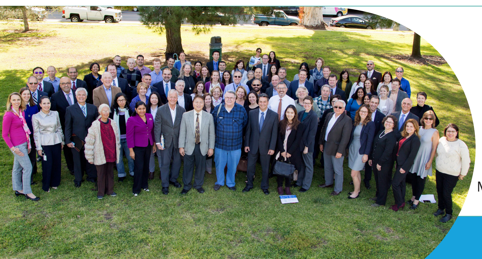
SOME OF THE DEDICATED MEMBERS OF ONE WATER LA'S STAKEHOLDER GROUP