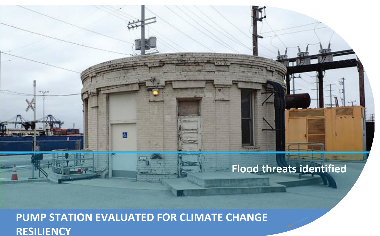
PUMP STATION EVALUATED FOR CLIMATE CHANGE RESILIENCY